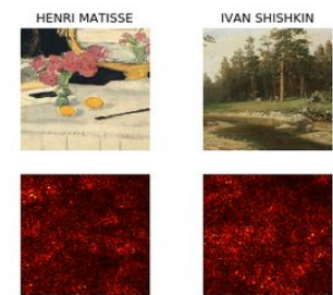
Fig.3: Saliency Maps

The transfer learning-based networks performed better than the feature extraction method traditionally used. Extensive tuning of the hyper parameters led to maximised performance on the ResNet that was pre-trained on ImageNet. Also extracting the features before the last fully connected layer and then performing classification yields lower performance than fine-tuning. Also, the high probability along the diagonal of the confusion matrix is indicative of the high accuracy in classification. By viewing the saliency maps of the images we observe the network does not focus on a single area of the image to perform classification.